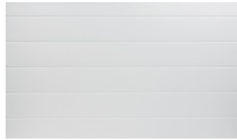
PENCIL GROOVE PANEL WITH STUCCO EMBOSSMENT