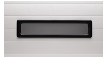
24" X 6" DOUBLE INSULATED ACRYLIC WINDOWS WITH BLACK FRAME