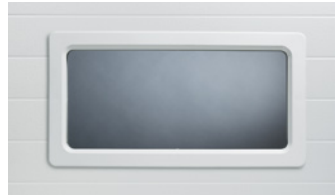
24" X 12" INSULATED GLASS Available with either a black or white frame.